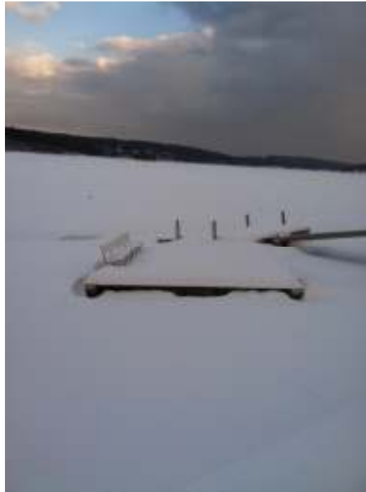
The docks and swim buoy frozen in place