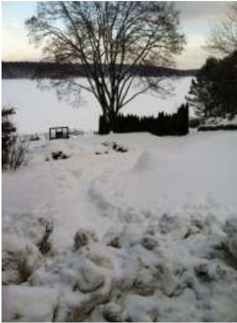
The beach road