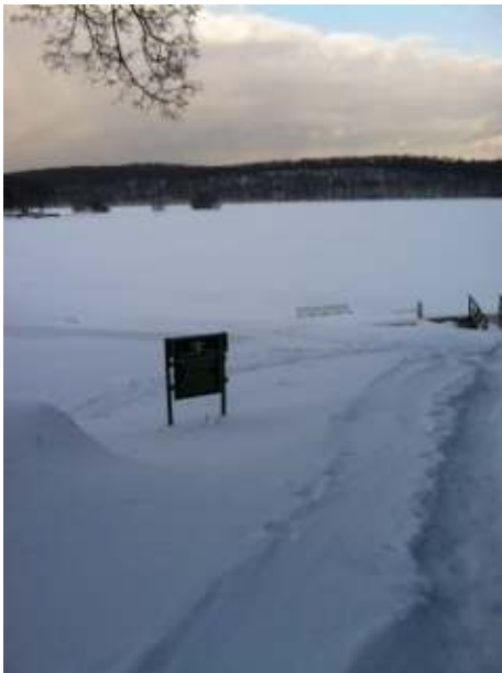
The snow is almost to the bottom of the beach sign!