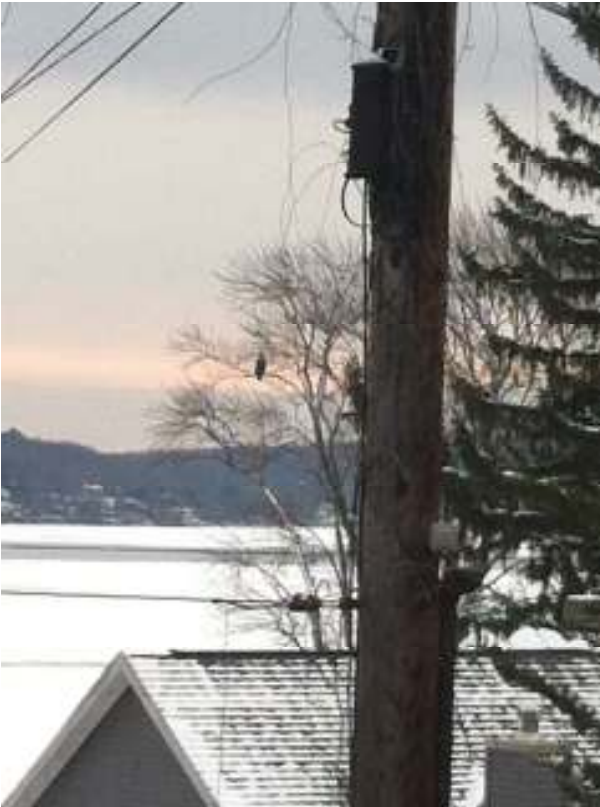
Knollcrest's resident bald eagle searching the last bit of open water in early January.