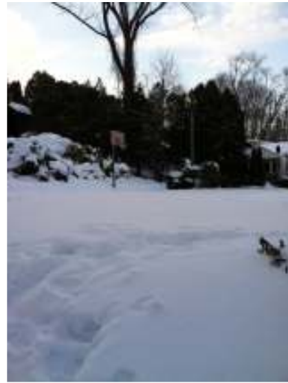
basket ball court