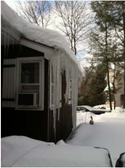
Icicles were abundant