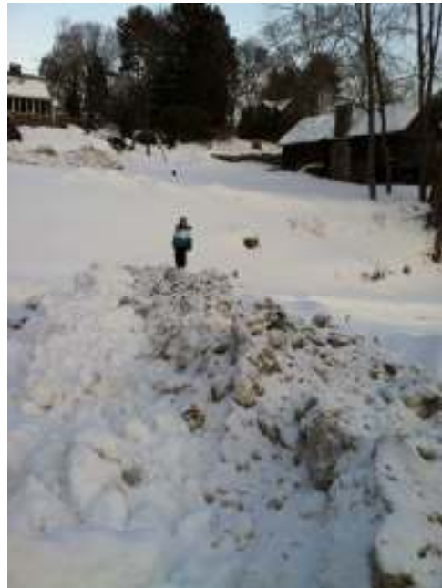
The mound of snow at the Marina