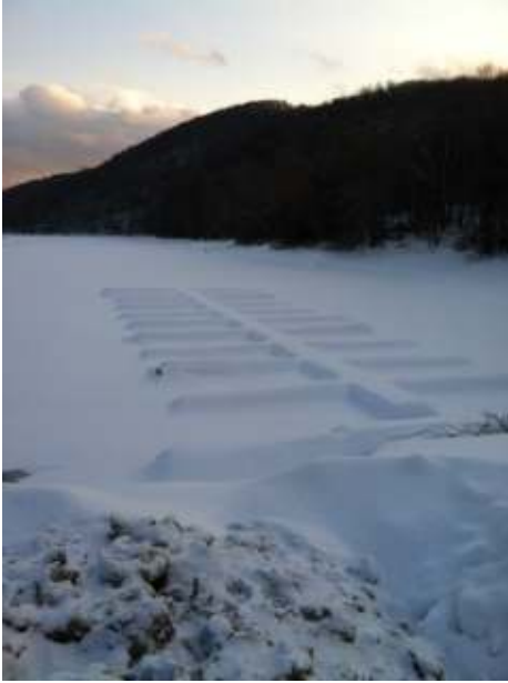
The docks full of snow