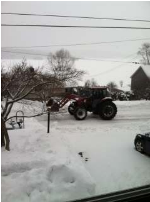
Bringing out the big guns to move all the snow