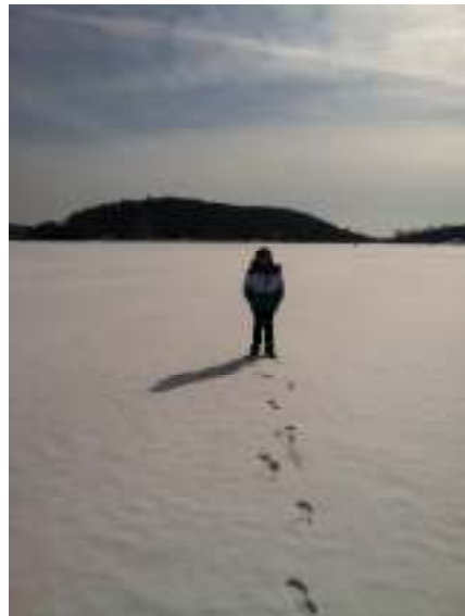
First walk on the ice. Candlewood Isle is in the background