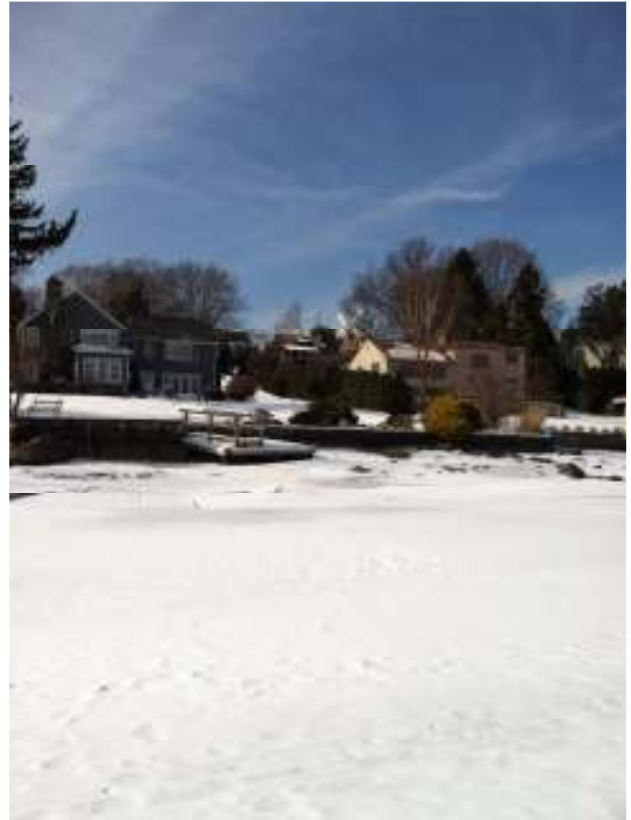
a view of the windmill taken from out on the ice