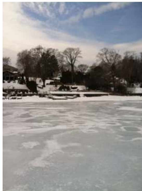
A view of the beach taken from the ice