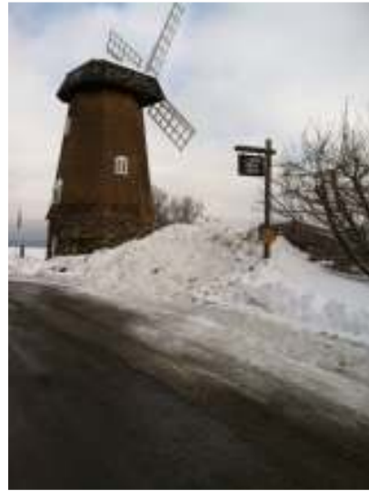
A huge mound of snow closes J Jarvis Moses circle